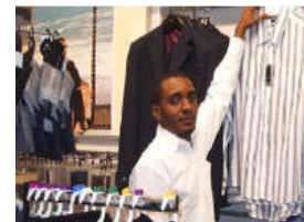
A student on work experience at Peacocks Stores

Phone 020 8443 4252 or email info@enfield-workex.org.uk