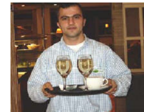
This student was offered a junior management position by the employer

When a small group of Business Studies students from Enfield College were going on work experience, their tutor told them it would enhance their studies, and might also provide them with a useful reference from the employer.