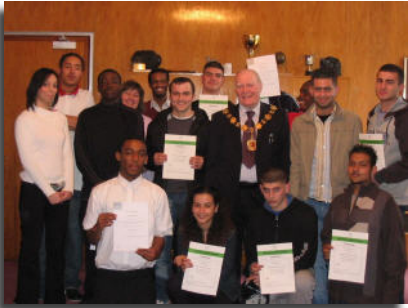
Enfield College students in the Mayor's Office

The students were presented with certificates at the Civic Centre by the Mayor of Enfield, Bill Price